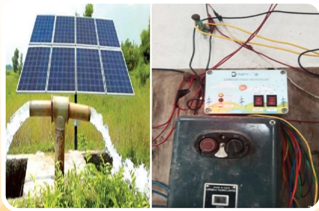
Photo 7- Sensors based motor switch for Solar Submersible pump