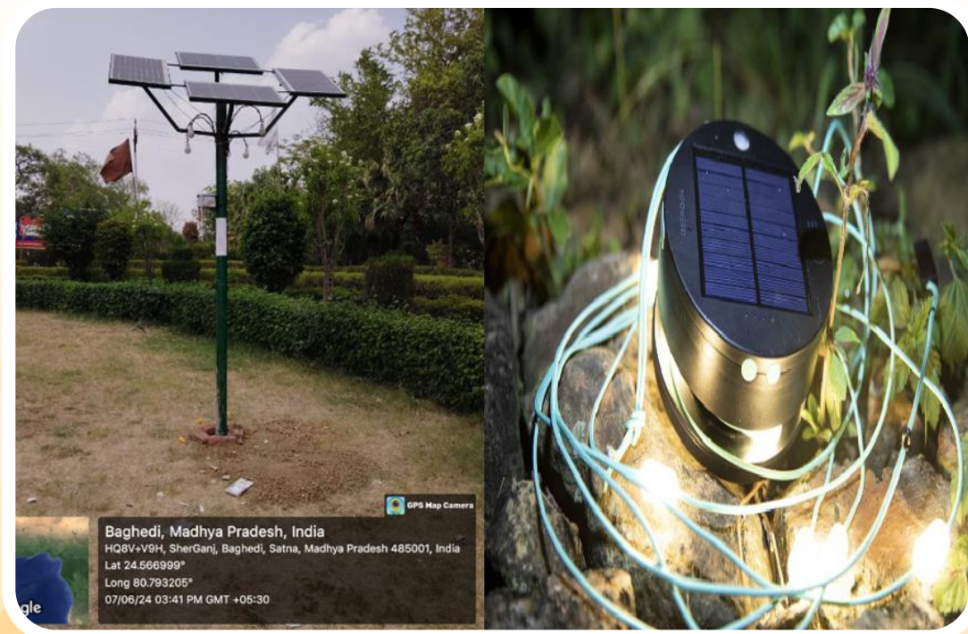
Photo11:-Sensor based automatic lighting system installed in the AKSU campus