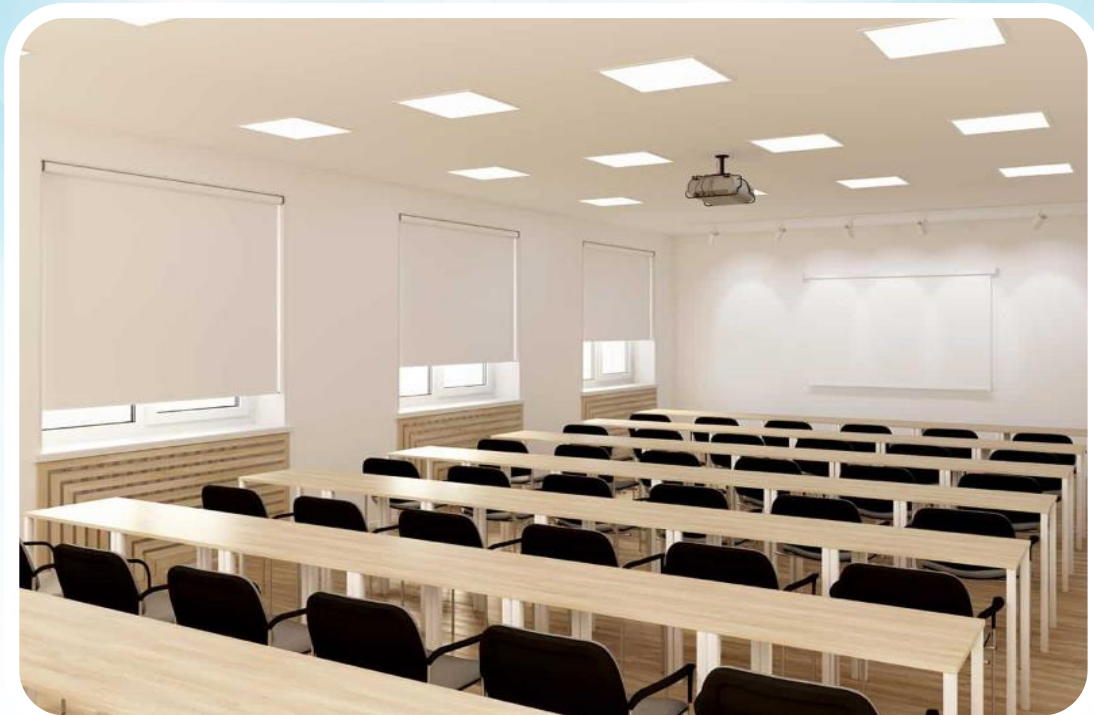
Photo 12: Sensor based light and fan system installed in Class Rooms