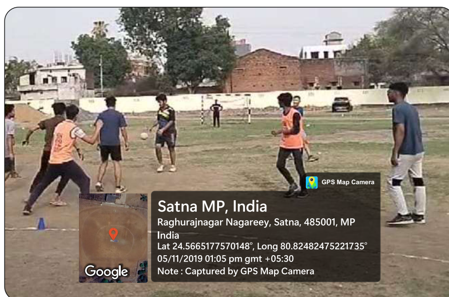
Photo 1 Intra University Handball Tournament 2023 -24