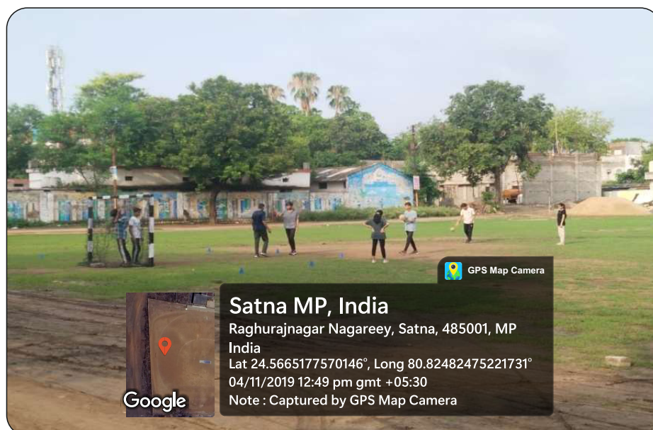
Photo 1 Intra University Handball Tournament 2023 -24