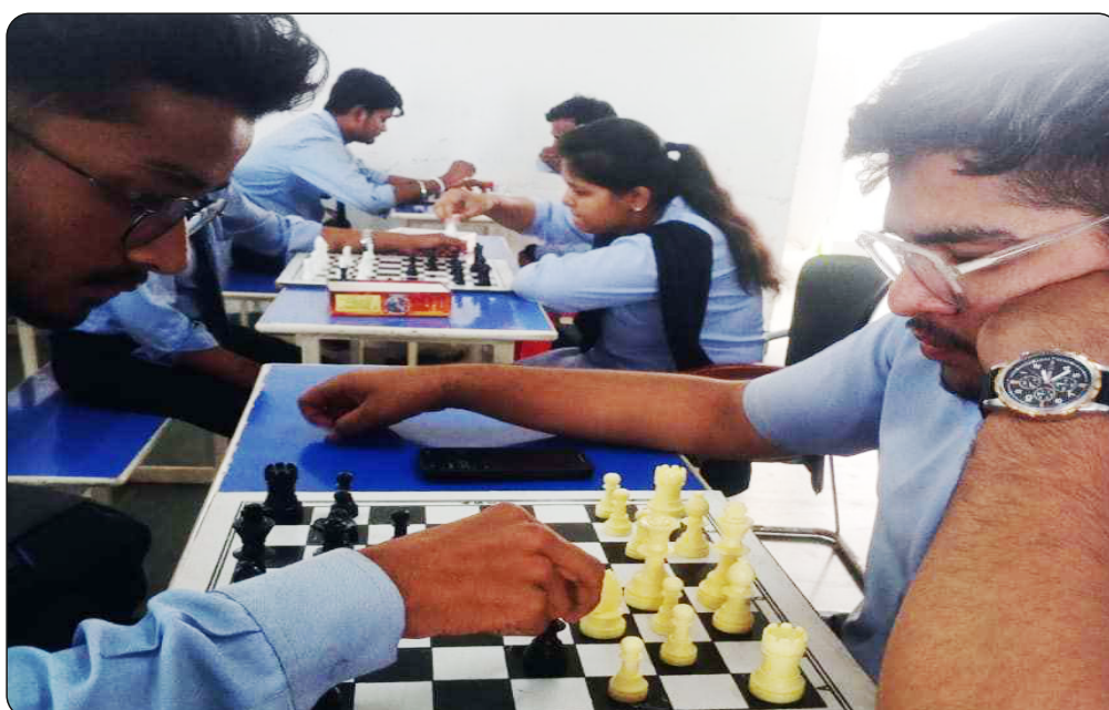
Photo 1- Intra University Chess Tournament 2023