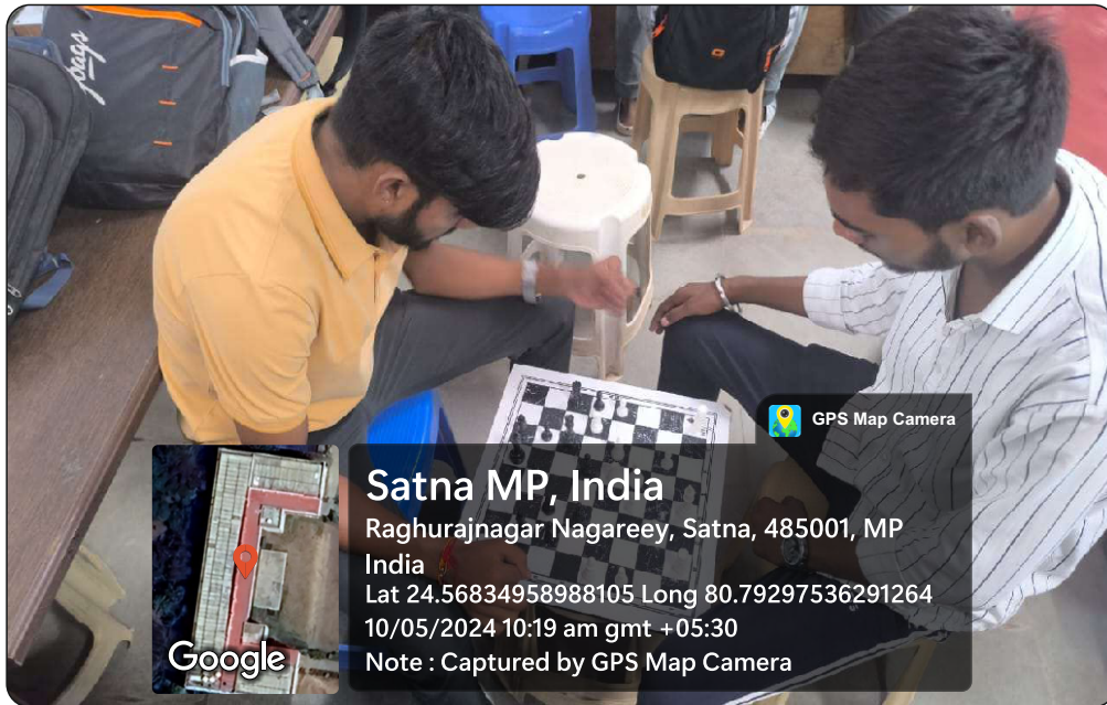
Photo 2- Intra University Chess Tournament 2023