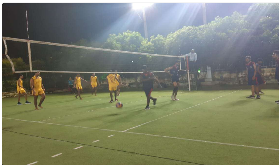
Photo 1 Intra University Volleyball Tournament 2023-24