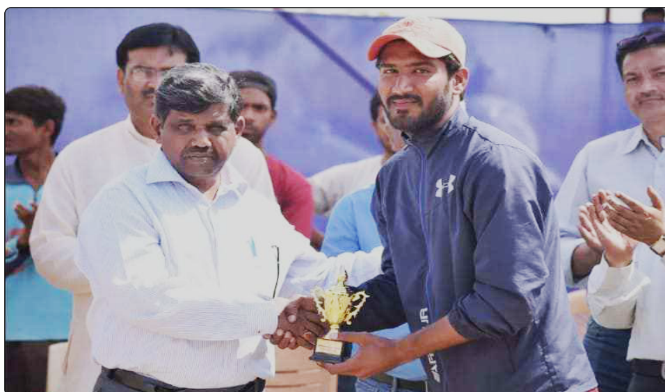
Photo 2 Intra University Volleyball Tournament 2023-24