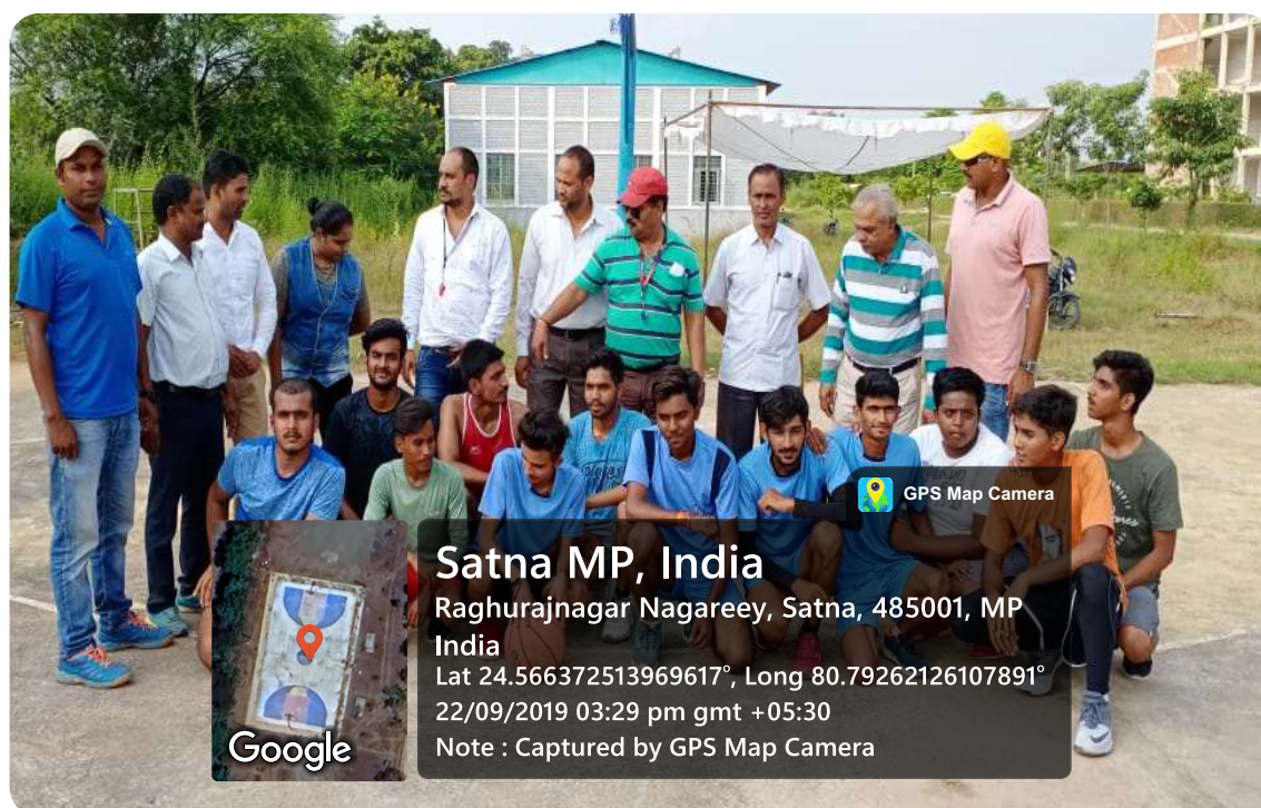
Photo 2 Intra University Basketball Tournament 2019-20