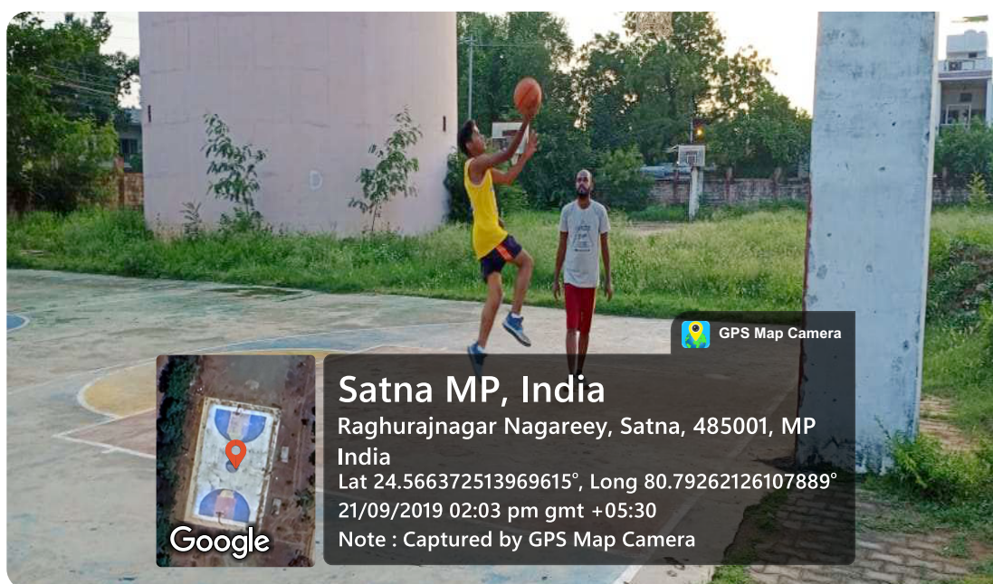
Photo 1 Intra University Basketball Tournament 20 19-20