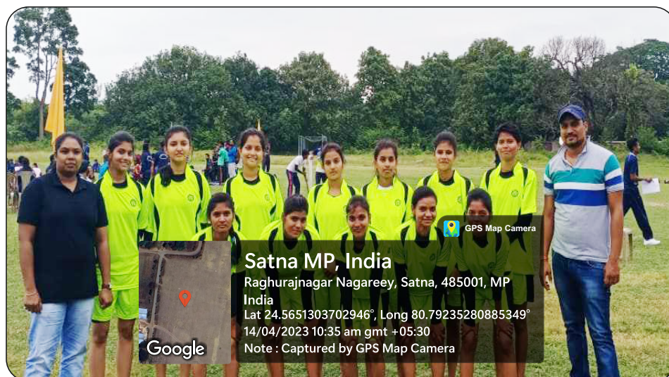
Photo 1 Intra University Volleyball Tournament 2022-23