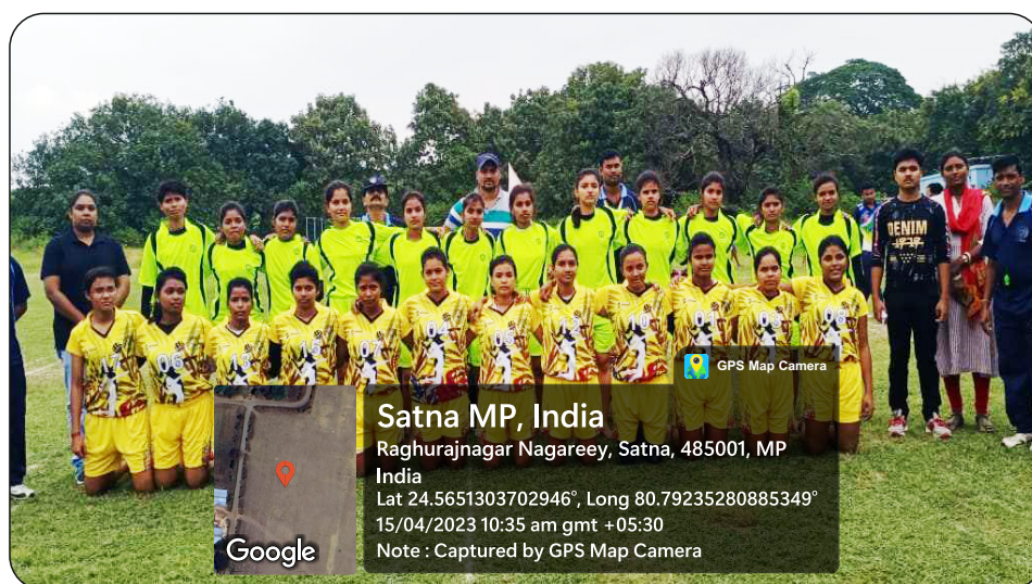
Photo 2 Intra University Volleyball Tournament 2022-23