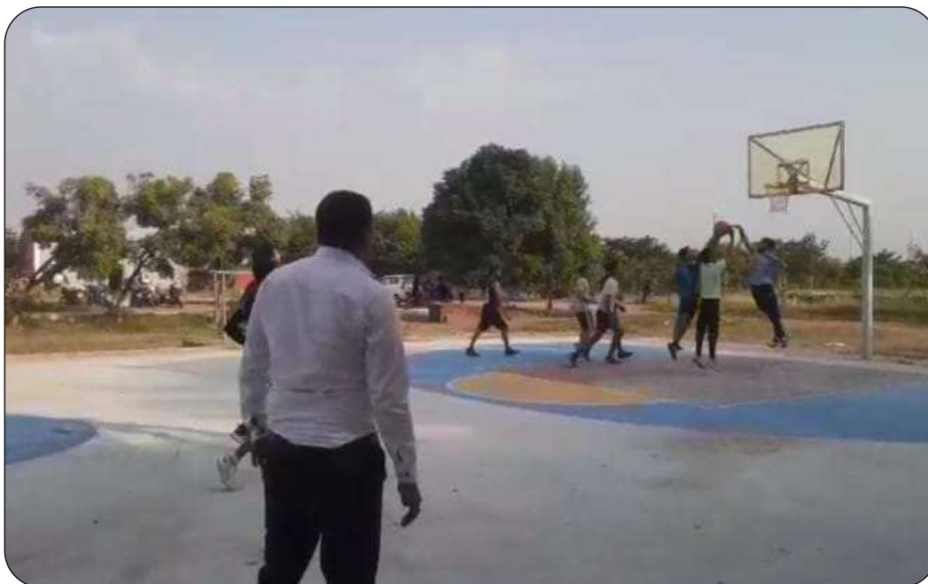
Photo 2 Intra - University Basketball Tournament 2022 -23