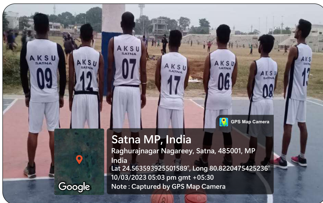
Photo 11ntra - University Basketball Tournament 2022 -23